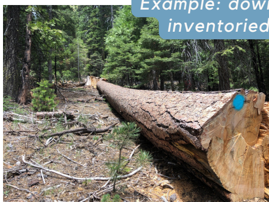
Example: downed PG&E trees inventoried for removal

The existing downed trees from previously completed PG&E treatments will be removed as part of this Project.