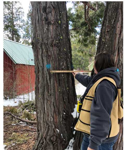
RCDTC forester measures the dbh of an incense cedar

The RCDTC forestry team will conduct site visits seasonally, as conditions and grant funds allow. During site visits, foresters will identify hazardous trees, such as dead, dying, and diseased trees, and trees that violate Public Resources Code 4291 (see page 4). These trees will be inventoried and marked for potential removal. It will ultimately be up to a licensed timber operator to decide what marked trees can be safely removed.